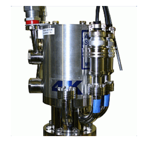
The above picture shows an instrumentation skirt with the electrical feedthroughs rotated 90 degrees upwards to allow for tight rotational clearances.