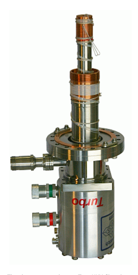
The above picture shows a True UHV Closed Cycle Cryocooler