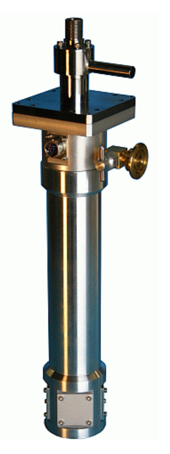
The above picture shows a cryocooler with a vacuum shroud, radiation shield, and sample holder installed.